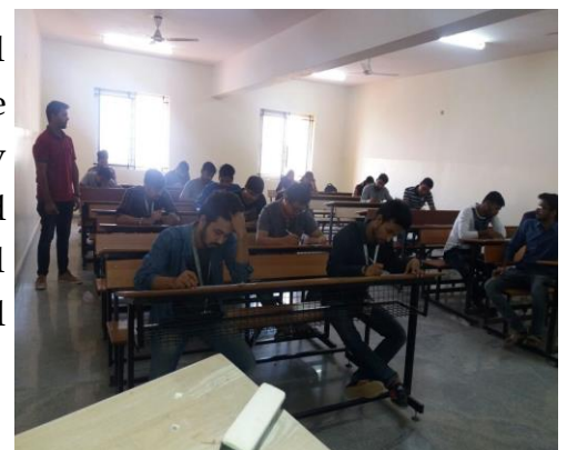
Aptitude and reasoning test

At present, the competition for employment is increasing and placement has become a challenging task. To equip the students with life skills and to train them on personality development, the Department of Computer Science and Engineering conducted a training program on Aptitude and Logical Reasoning on 2 nd November 2017. Test was conducted on the same day to examine the students abilities.