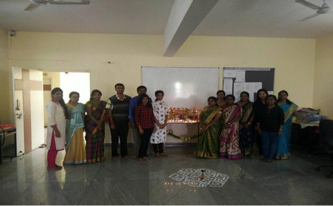
Dasara Celebration @ Department