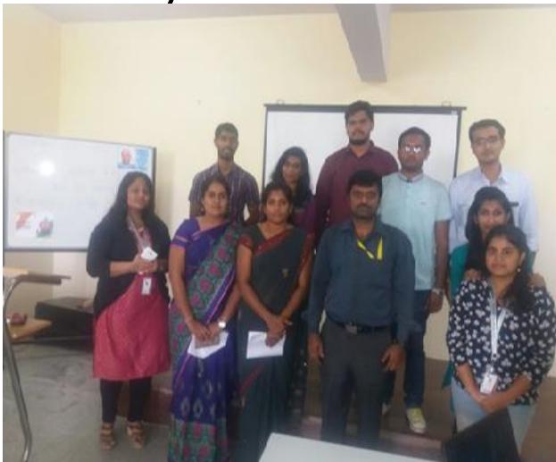
Students and faculties participation

“Rastriya Ekta Diwas” was celebrated to mark the birthday of Sardhar Vallabai Patel-the Iron man of India by IT club on 8 th November 2017. A Speech Competition was held on the topic “Sardhar vallabai patel and his thoughts”. Students of various branches participated and produced a informational speech. Staffs and fellow students understood the value, and responsibility of them towards the nation. The interactions enhanced patriotic feelings in the young students. Event was concluded with national anthem.