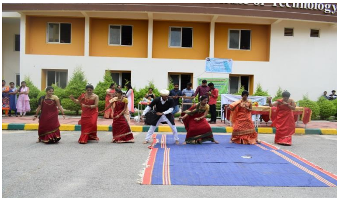
Kodava Dance by 3rd sem students @ heritage club