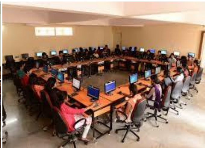
Hands on session on networking