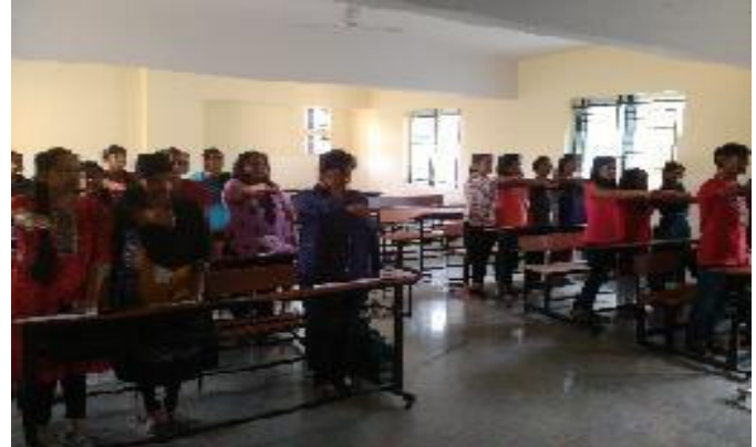
Students taking Oath on India Movement @ Department