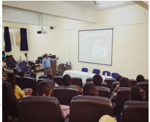
Sensitization program on digital India