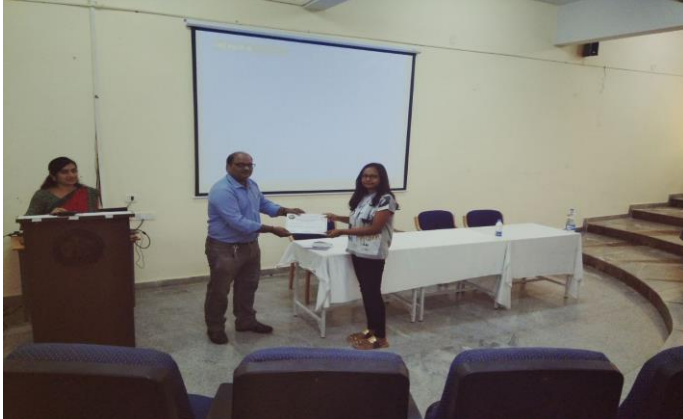
Student receiving Certificate from Jetking